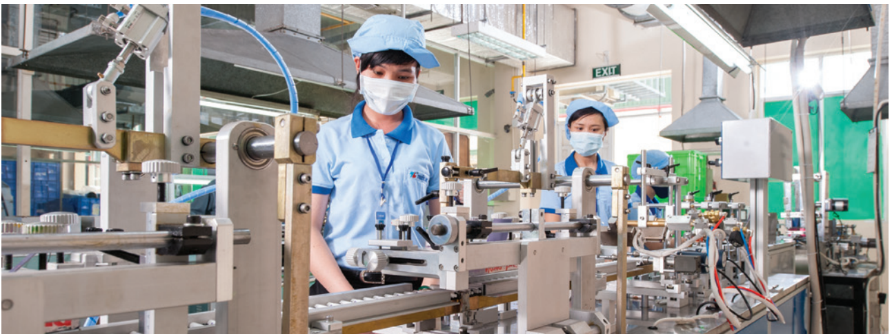
TLG developed an innovative proprietary production line.