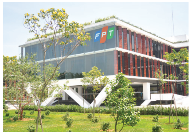
One of FPT's own campuses in Hoa Lac Hi-tech Park, Hanoi.