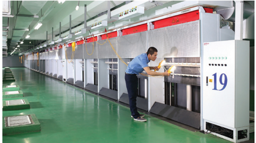
STK uses advanced production management systems.