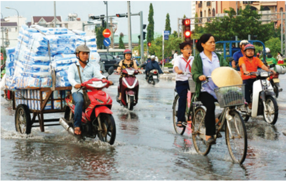
Urban flooding has become a wide spread phenomenon and a major concern in Ho Chi Minh City in recent years.