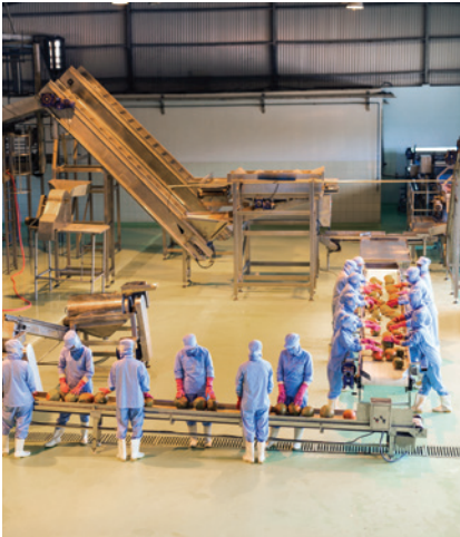
Nafoods has established an integrated value chain for fruit processing.