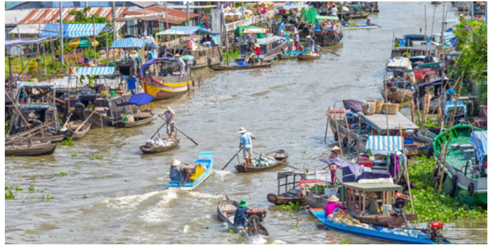
The Mekong Delta in the south of Vietnam is already experiencing the impacts of climate change.

over the next 20-30 years. Just 28% of Vietnam's overall land area is suitable for agriculture, with only two thirds of this capable of high-intensity crop production.