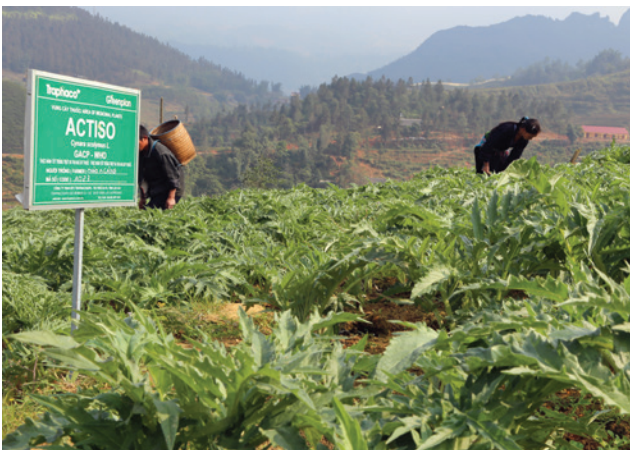
Traphaco's artichoke plantation in Sapa, north-west Vietnam.